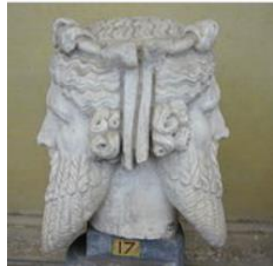
Janus - God of Beginnings and Transitions